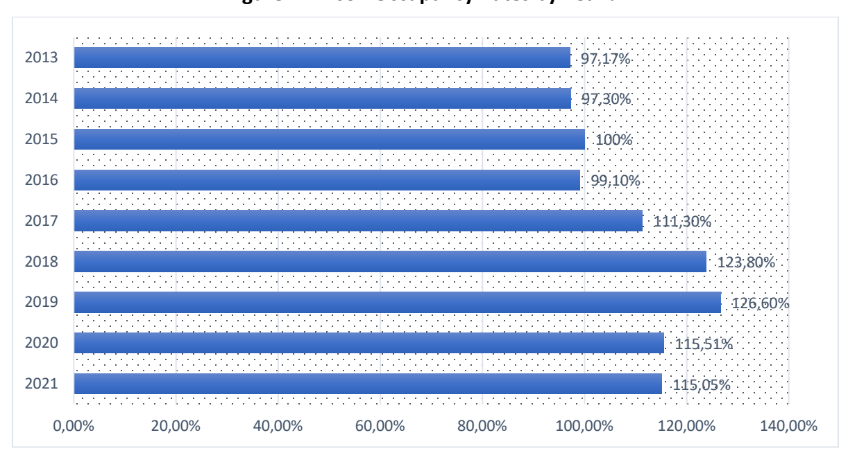
Figure 2. Prison Occupancy Rates by Year %

that the political power merely disregards the "exceptional" state of incarceration, which according to the European Convention on Human Rights (ECHR) and to the case law of the European Court of Human Rights (ECtHR) must be an exception, and individuals are deprived of their liberty at the hands of the judiciary.